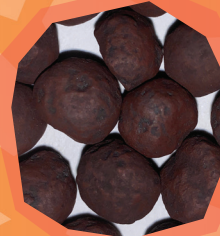
TACONITE (IRON ORE)