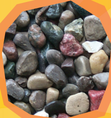
NATURAL STONE (GRAVEL)